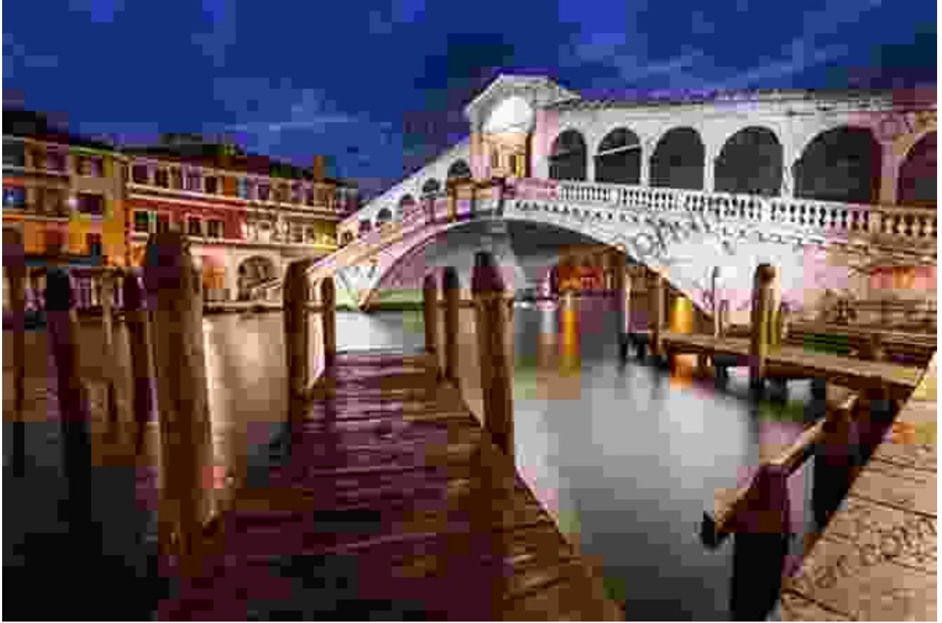
The Rialto Bridge